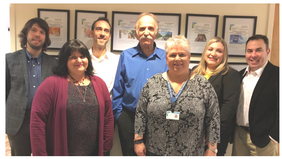
Leaders at Regional Forum - Names Listed at End of Article

"It is so exciting to be able to bring a nationally-known figure, such as Harvey Rosenthal, to Putnam to discuss with individuals and providers in the mental health system the legislative advocacy efforts that are being brought forth on our behalf. It is