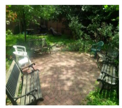
Crisis Respite & Step-Down Housing two locations in Manhattan . . . short-term stays . . . staffed by peers with lived experience with mental illness.

Outreach, engagement, care management, supportive housing, peer support, respite, home and community based support & skills building.