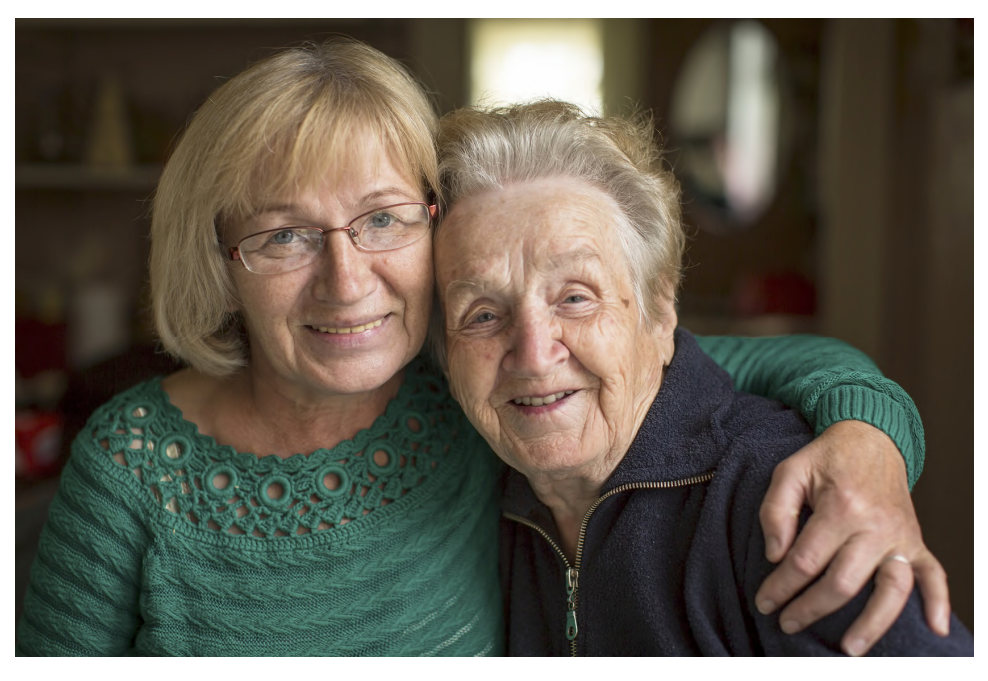
of the 21st century, (2) provide an overview of the mental and substance use disorders of old age, (3) note the developmental challenges of old age, and (4) propose a policy agenda to address the critical mental health needs of older adults.

In what follows we (1) review the demographic projections for the first half